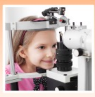
Quality Care and Quality Product access